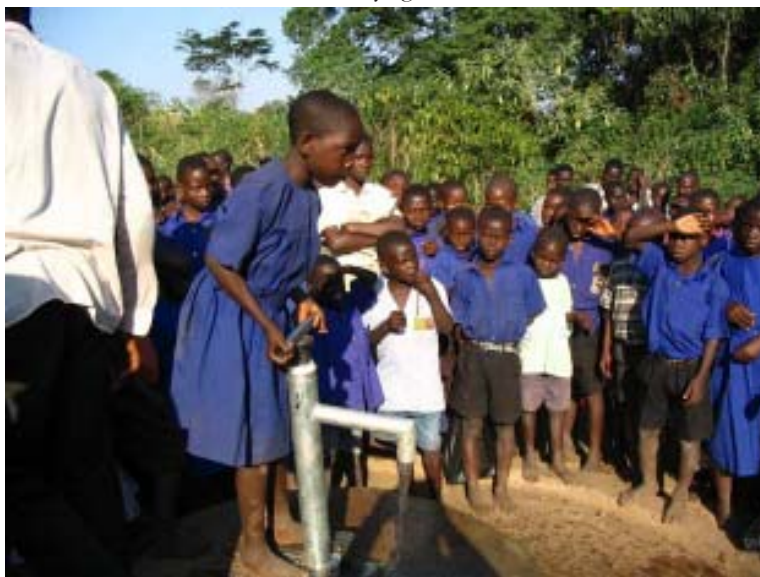
Karutu school district, United Republic of Tanzania

Three keynote speakers highlighted the need for dedication and commitment towards a minimum quality package for water, sanitation and hygiene education for schools. Each used a different entry point to reflect concern for the urgent need to create a template for action calling on the experience and expertise of all stakeholders to improve the quality of life for all children, and in so doing, to meet the MDG target for water and sanitation. Each speaker also conveyed an optimistic approach to the viability of meeting the target in an inclusive and collaborative way.