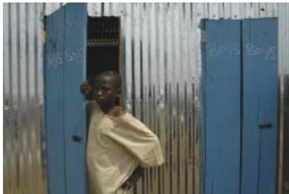
Liberia

The following pages are comprised of selections from the case studies that were prepared for the Roundtable by UNICEF Water, Environment and Sanitation programme officers working with government counterparts. Roundtable presentations by government officials and youth delegates are highlighted throughout.