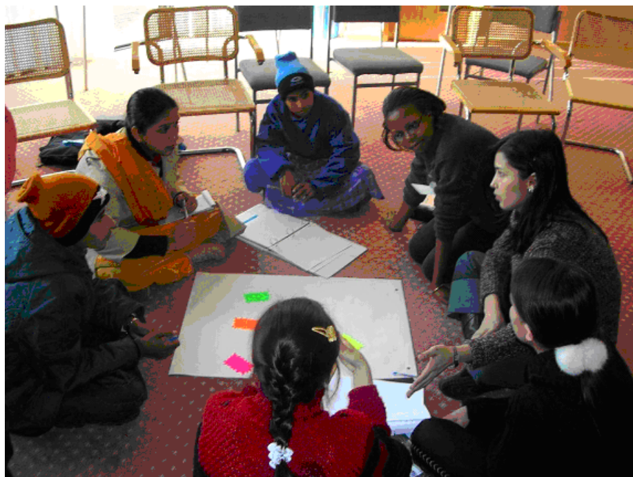
© Nina O'Farrell, 2005, Oxford, UK